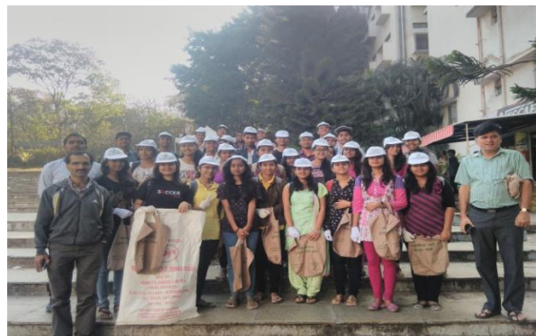
Swachh Bharat Abhiyaan-10 th August, 2016