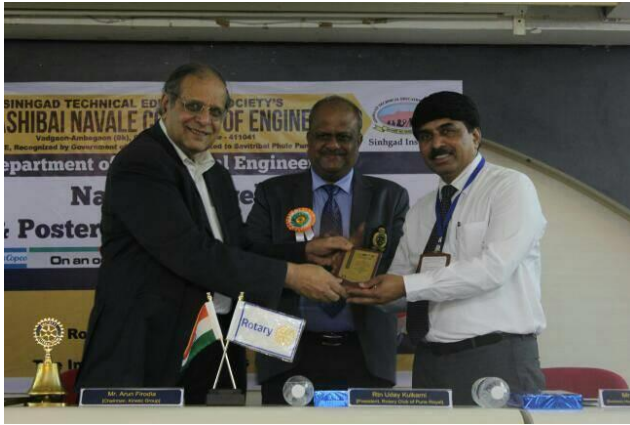
National Level Project and Poster Competition 6&7 April 2017