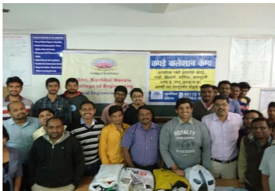
Cloth Donation 30/12/2016