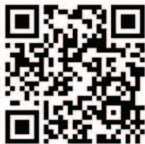
Palos Verdes Nature Preserve Notify Me Listserv