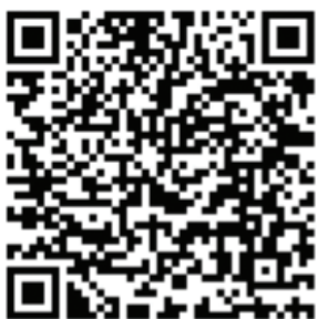
Trail Conditions & Alerts

As we approach colder and wet weather conditions, make sure to check rpvca.gov/trailalerts before heading out on a hike! The Palos Verdes Nature Preserve is subject to closure during wet conditions as trails get muddy. This protects the sensitive habitat by ensuring water-logged areas can adequately dry out and enhances public safety if trails become slippery. Be one step ahead and subscribe to the "Palos Verdes Nature Preserve" listserv to get notifications via e-mails and/or updates on upcoming meetings, projects, and trail conditions.